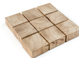
2" depth x 4" x 4" Black Locust pavers on mesh, in tile pattern, with 3/8" spaces.