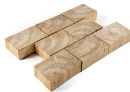
2" depth x 4" x 6" Black Locust pavers on mesh, in running bond pattern, no spaces.