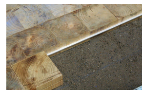
1½" x 4 x 4 black locust with aluminum spine on gravel.

Sizes: Pavers can be cut to most any thickness. We recommend they be 3" to 4" in depth, with minimum of 1½". Standard face sizes: 4" x 4", 4" x 6". Other sizes include: 4" x 8", 4" x 10", 6" x 6". Custom face sizes on request.