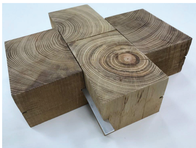
2 1/2 depth x 4" x 6" rectangular Black Locust pavers with aluminum spline for tongue and groove installation.