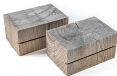
Weathered pavers with grooves.

Black Locust is a medium-sized deciduous tree native to the central-eastern United States. Extremely hard, and rot resistant. Black Locust will “weather” in a gray tone. Once “weathered”, the pavers will remain unaltered in appearance for years. Because of its’ superior rot resistance, Black Locust is commonly used for fence posts, boat building, and mine timbers.