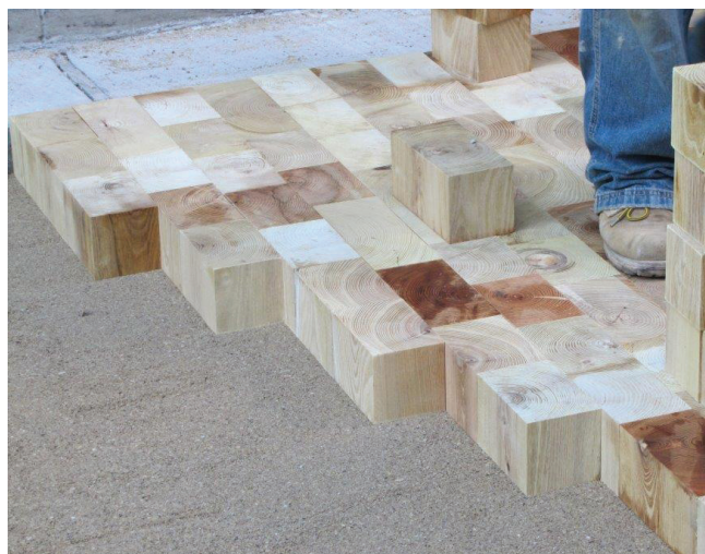
Black Locust installation over sand, no grooves, no mesh.

4.) All Black Locust areas must be framed with wood, concrete, or other material to keep pavers in place at their perimeter.