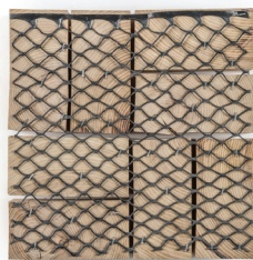
Pavers on plastic mesh panels.

3.) Pavers on plastic mesh panels. Panel size approximately 2' x 3', with or without spaces between pavers. They can be ordered with uniform spacing up to 1/2" in width (ADA compliant)