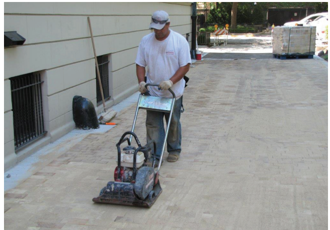
Vibrating sand joint filling.