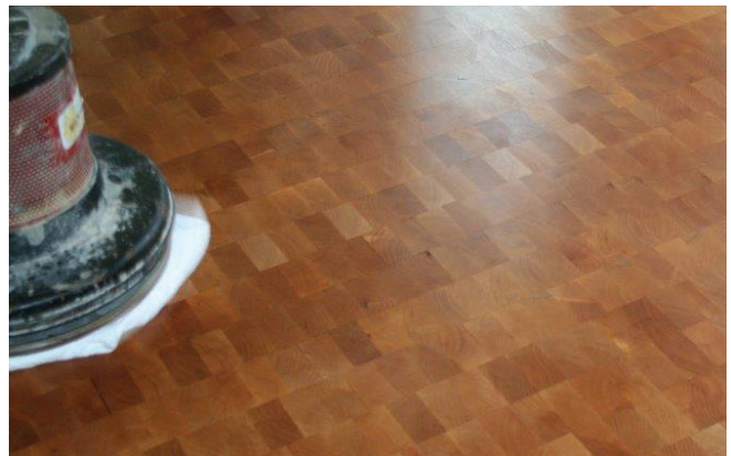
Buffing Woca Oil

Woca Master Oil is considered the primer application. Its role is to act as a base for subsequent oil applications. Choose your starting area and pour the oil into a paint tray. Spread