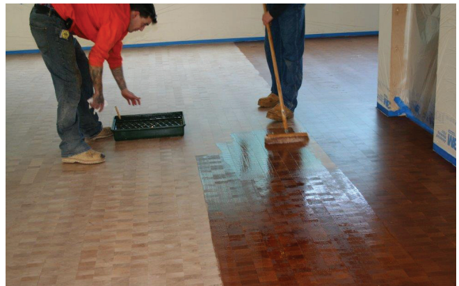
Applying Woca Oil using lambswool applicator

the oil with a ¼” nap paint roller and extension pole or lambs wool applicator. Roll the oil as if you are painting the floor. Continue to spread oil until finished. Do not buff the oil into the floor, as this forces too much oil into the floor and the oil will be too deep. This may cause later bleed back and prolonged drying. When finished, rest your roller in the paint tray or on cardboard. Inspect for shiny spots. Within 30 minutes buff or wipe the entire surface with clean white towels to remove any shiny spots and/or excess oil. Coverage may approximate 130-170 sq. ft. per liter. It is best to let this (primer) application dry and harden for 24-48 hours.