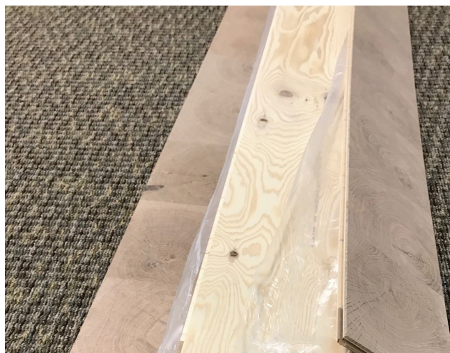
Engineered End Grain planks remain in packaging until installed

We are often questioned about the humidity being too high or too low. Humidity maintained above 60-70% at normal residential temperatures can adversely affect wood components. Humidity sustained at or above this level can result in an EMC of 12% or more with associated expansion. Humidity maintained at or below 25-30% can adversely affect wood components and result in an EMC below 6%.