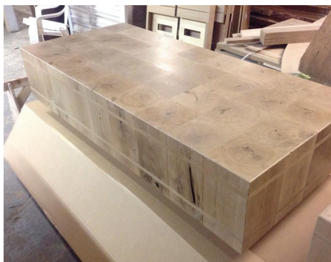
Coffee table with Engineered End Grain White Oak surface